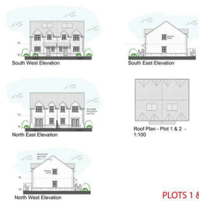
PLOTS 1 & 2 - PROPOSED ELEVATIONS