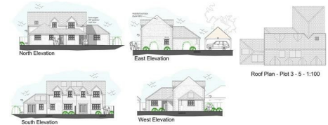
PLOTS 3, 4 & 5 - PROPOSED ELEVATIONS